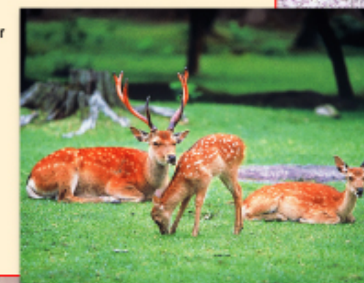
Nara Park (Deer Park)