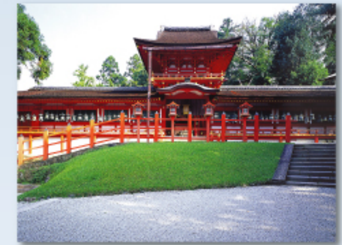
Kasuga Grand Shrine