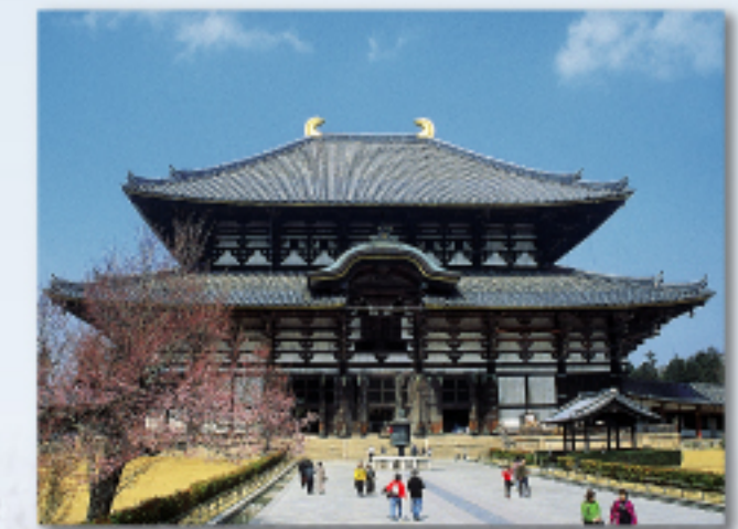
Todaiji Temple Daibutsu-den Hall