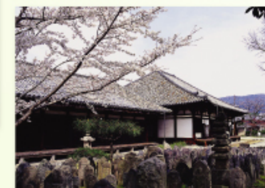
Gangoji Temple Gokurakubo