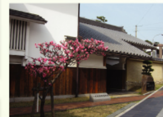
Daijō-in Cultural Hall