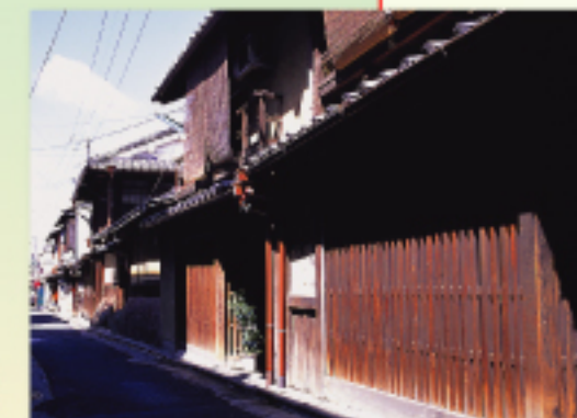
Vicinity of Naramachi