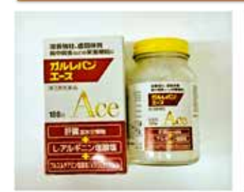
Garureban Ace revitalizer