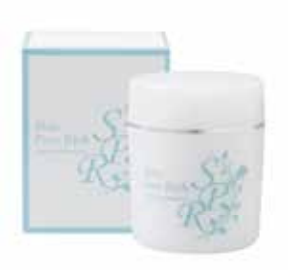
Skin Pure Rich cream