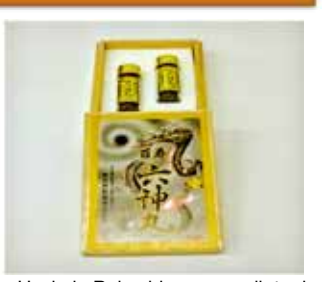
Akadama Icho-gan S digestive medicine Hyakuju Rokushin-gan cardiotonic