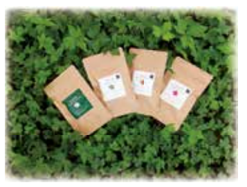
Yamato Angel Grass Tea (Straight tea)

<Inquiries> Nouyusha Ohindo website: http://www.nouyusha.com/? pid=94095378 Seikatsu Club Kanagawa