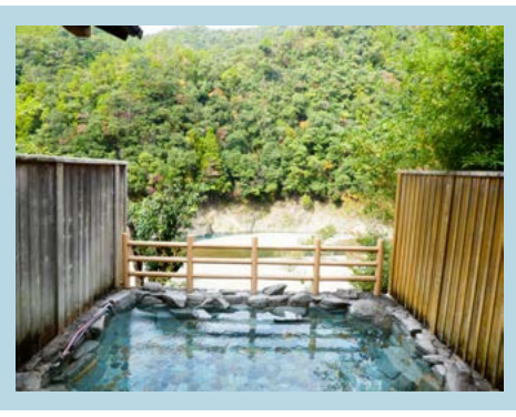
Relaxing in Tousenji hot springs

Did you know that Totsukawa village is famous for its hot springs? There are 18 hot springs in Totsukawa village, with the majority being in the heart of the village. It is said that due to the high amount of sulfur used in the Tousenji hot springs, there are noticeable effects on cuts, burns, muscle pain and other ailments.