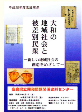
Posters on the exhibitions in 2016/17

On the basis of the research, the Center organizes exhibitions, open to the public, mainly on the relationship between different groups who had been discriminated against and mainstream local communities. Special exhibitions on specific issues are organized when the occasion arises.