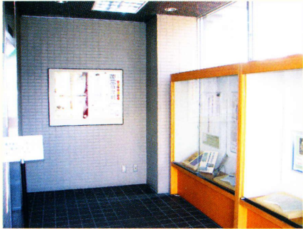
Second Floor Lobby