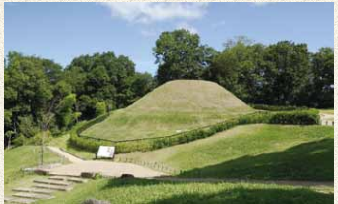
Takamatsuzuka Tomb and Mural Paintings One of the components of "Asuka-Fujiwara", and is well known for the colourful mural paintings that were discovered during archaeological excavations in 1972. The mural painting depicting men and women, which is similar to a mural painting from Tang Dynasty China, is a valuable source in understanding the dress and manners of that time and is designated as a national treasure.

only prove it — for example, if you can prove that it was brought from China — I think it can be a quite promising proposal. It does not matter if individual components do not look so good as their counterparts in Chang'an of Tang Dynasty China. What really matters is the fact that Japan transformed itself into a truly modern state at that time by Buddhist laws and ritsuryo . This is an amazing thing.